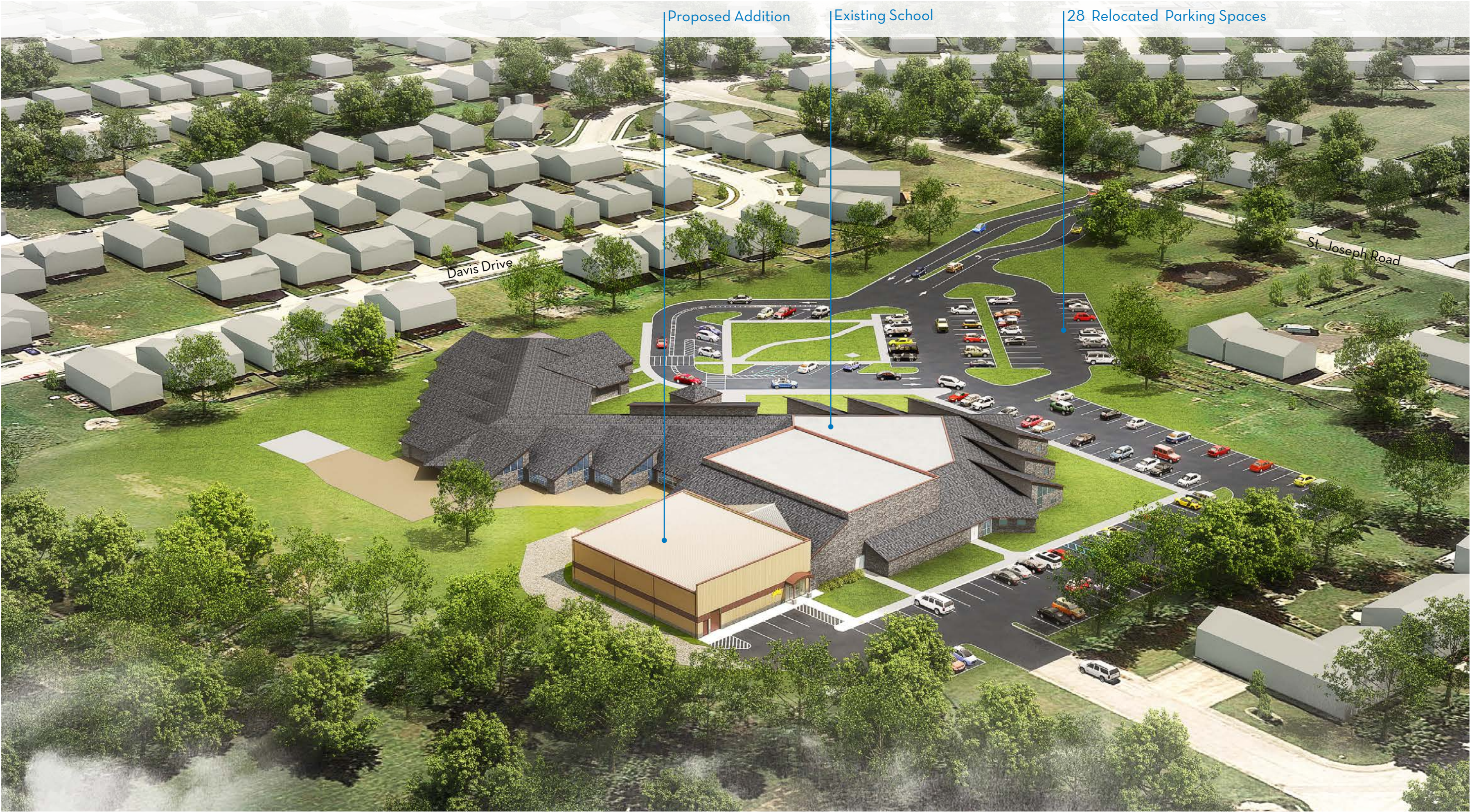
Aerial - View form North