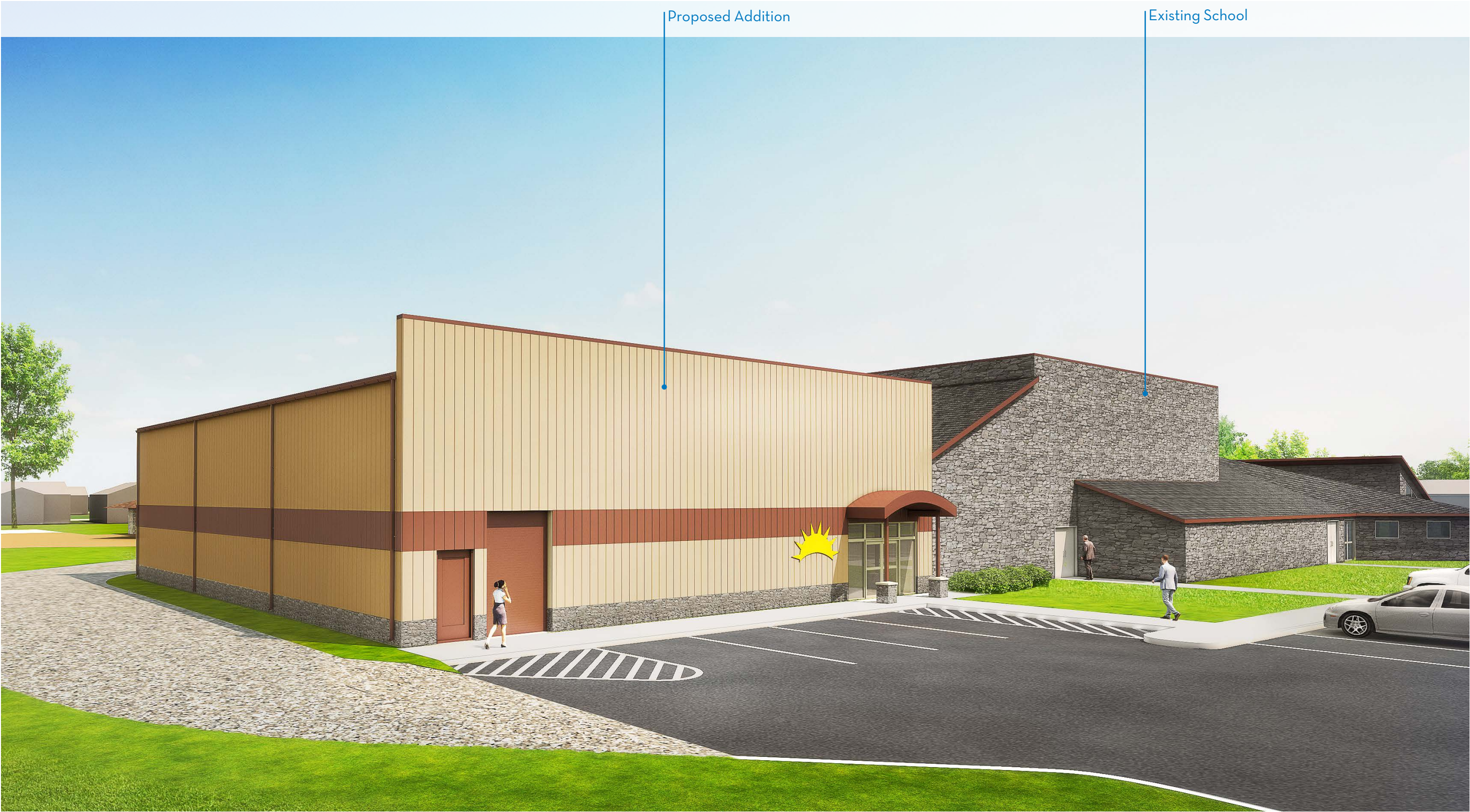
Ground - View form North